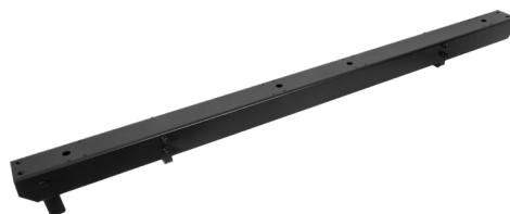
AP6TH2B1 / AP6TH2B2